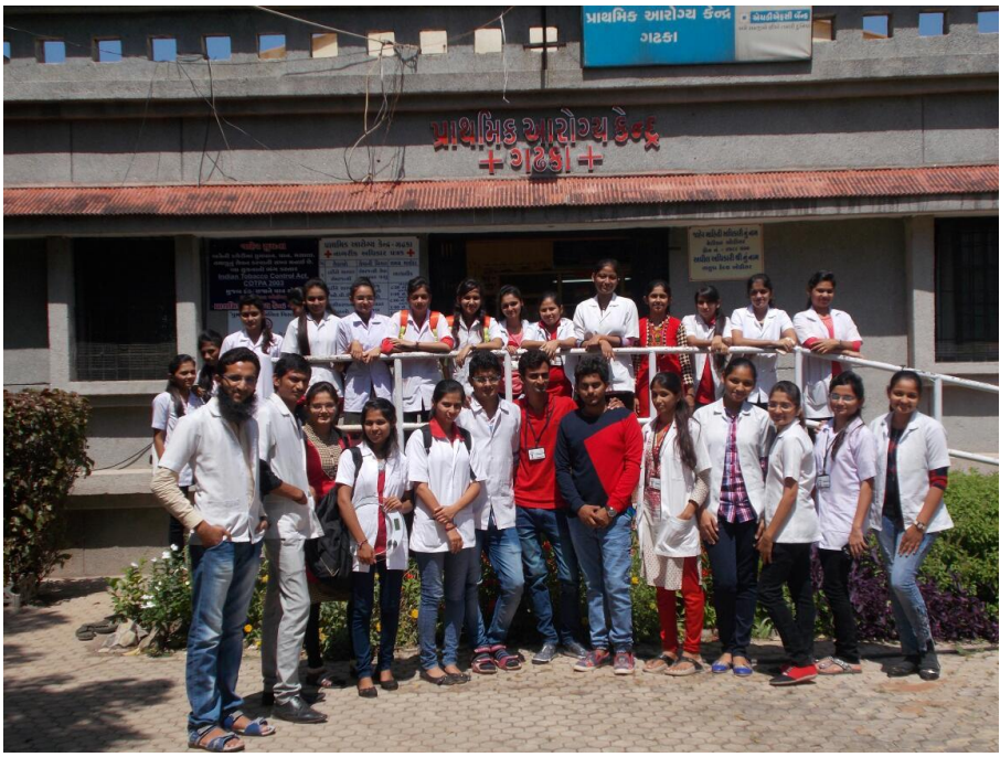
Total 65 subjects were evaluated at Gadhka and Sardhar.