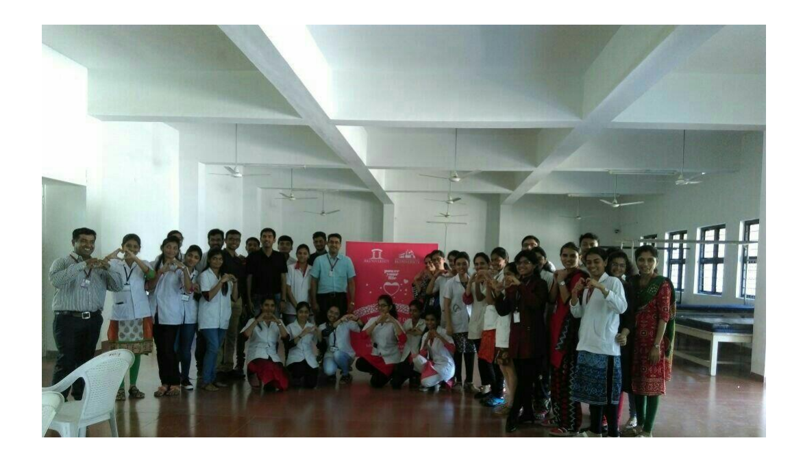
Total 110 individuals were checked at SOPT including RKU faculties and patients.