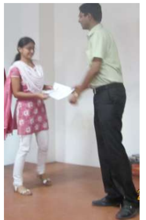
The winners in different events were facilitated by CERTIFICATE OF EXCELLENCY by faculty.