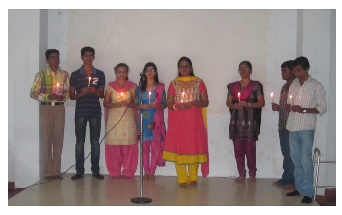
1<sup>st</sup> semester students with mock-drama – enlightening life