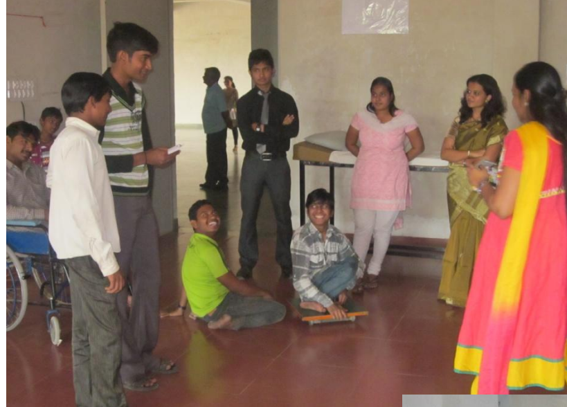
Students interacting with disables arrived from Apang Bal Gruh, Bhaktinagar, Rajkot. Fun loving games were also organised for disables.

Students at platform presentation on global theme of 2012 on Disability