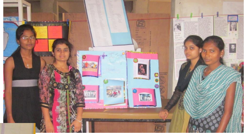
More than 24 posters were displayed in poster presentation competition including 85 students participants.

students with their innovativeness in form of Poster presentation