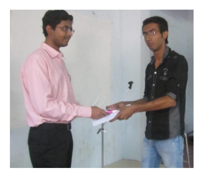
Winners were felicitated with certificates and gift of Book