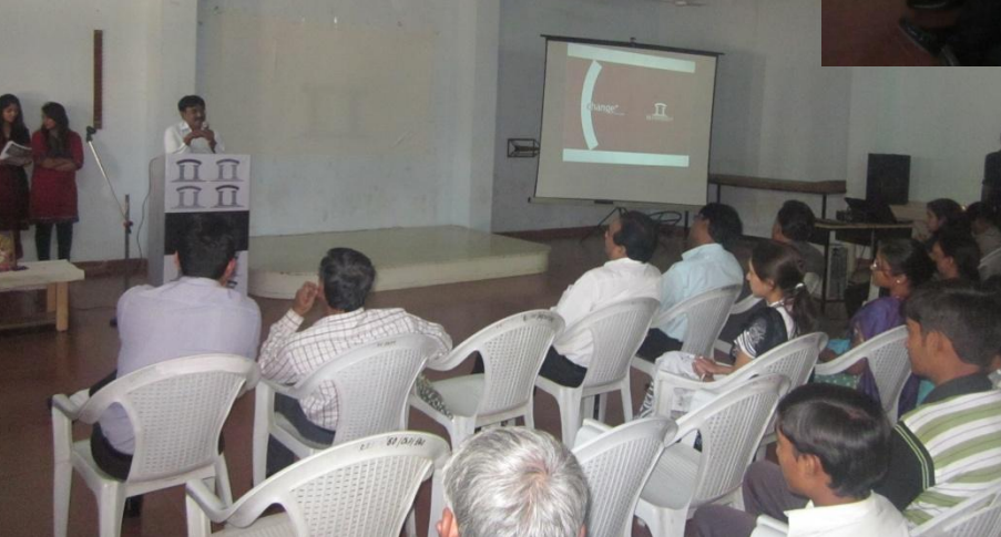
WHO's mission is to enhance the quality of life for people with disabilities through national, regional and global efforts and to raise awareness about the magnitude and consequences.

The day aims to promote an understanding of disability issues and mobilize support for the dignity, rights and wellbeing of persons with disabilities. It also seeks to increase awareness of gains to be derived from the inclusion of persons with disabilities in every aspect of life.