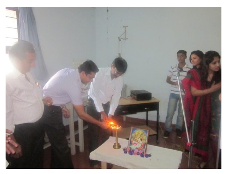
To support the International Day of Persons with Disabilities on 3<sup>rd</sup> December 2012, Students and faculty of School of Physiotherapy has organized several events on 2<sup>nd</sup> December 2012 with persons with disabilities.

Global Theme: " Removing barriers to create an inclusive and accessible society for all"