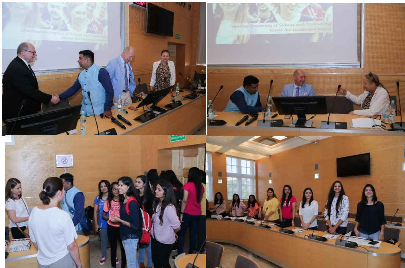
Opening ceremony of a 3-Week Summer Course on Selected Biomedical Engineering Methods in Preventive, Predictive and Personalized Medicine and Physiotherapy

11 students of School of Physiotherapy RK. University accompanying by one of the Faculty visited Wroclaw University of Science and technology, Poland for a 3 week Summer Course on Selected Biomedical Engineering Methods in Preventive, Predictive and Personalized Medicine and Physiotherapy Organized by Department of Biomedical Engineering in cooperation with Wroclaw University school of Physical Education, Faculty of Physiotherapy and Regional Specialist Hospital,Wroclaw,Poland in addition to that sightseeing around Poland for 2 weekend is also provided by the Wroclaw University of Science and Technology